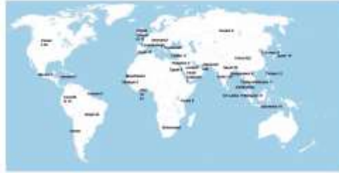
Mapping of International Students: Number of Students by Country (114)